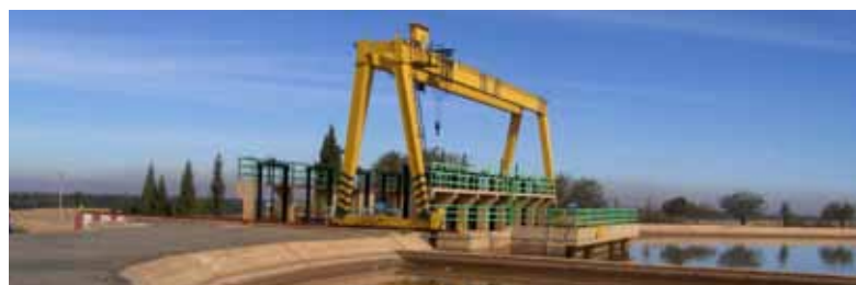
Facility for Euro-Mediterranean Investment and Partnership