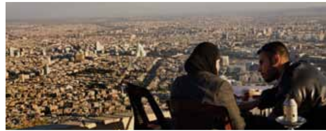
Facility for Euro-Mediterranean Investment and Partnership