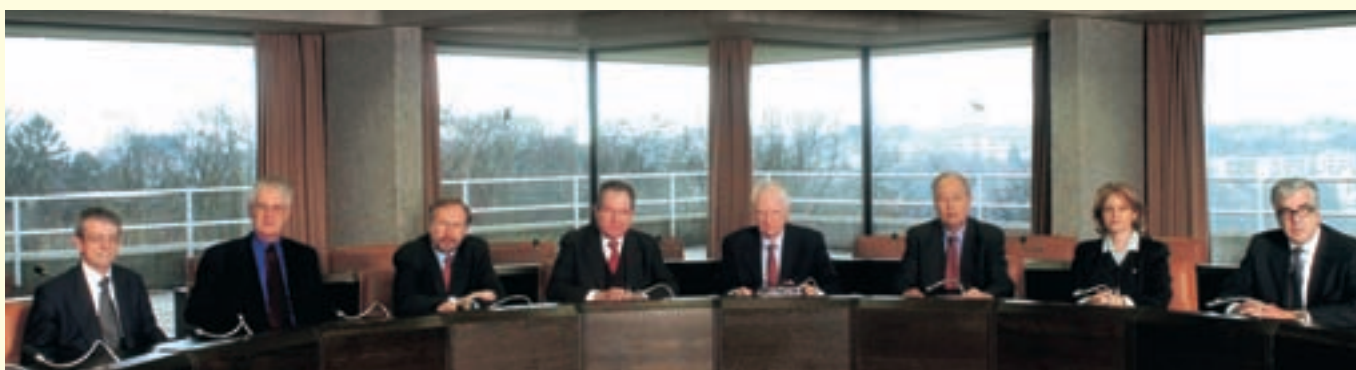
The Management Committee

The EIB’s Board of Governors authorised the Bank to release up to 2 billion from its operating profit for venture capital operations to be arranged by the EIF between now and 2003.