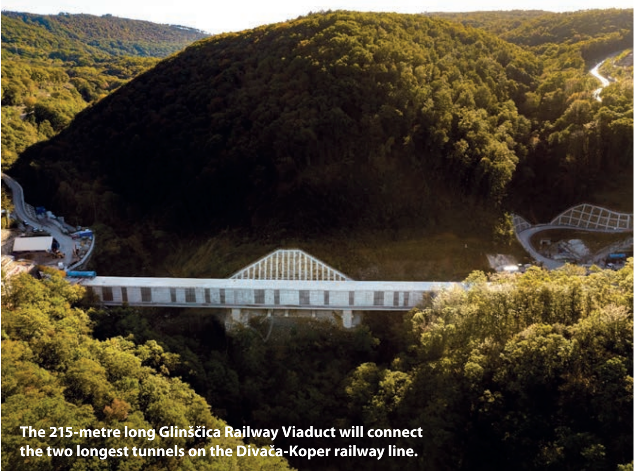
The 215-metre long Glinščica Railway Viaduct will connect the two longest tunnels on the Divača-Koper railway line.