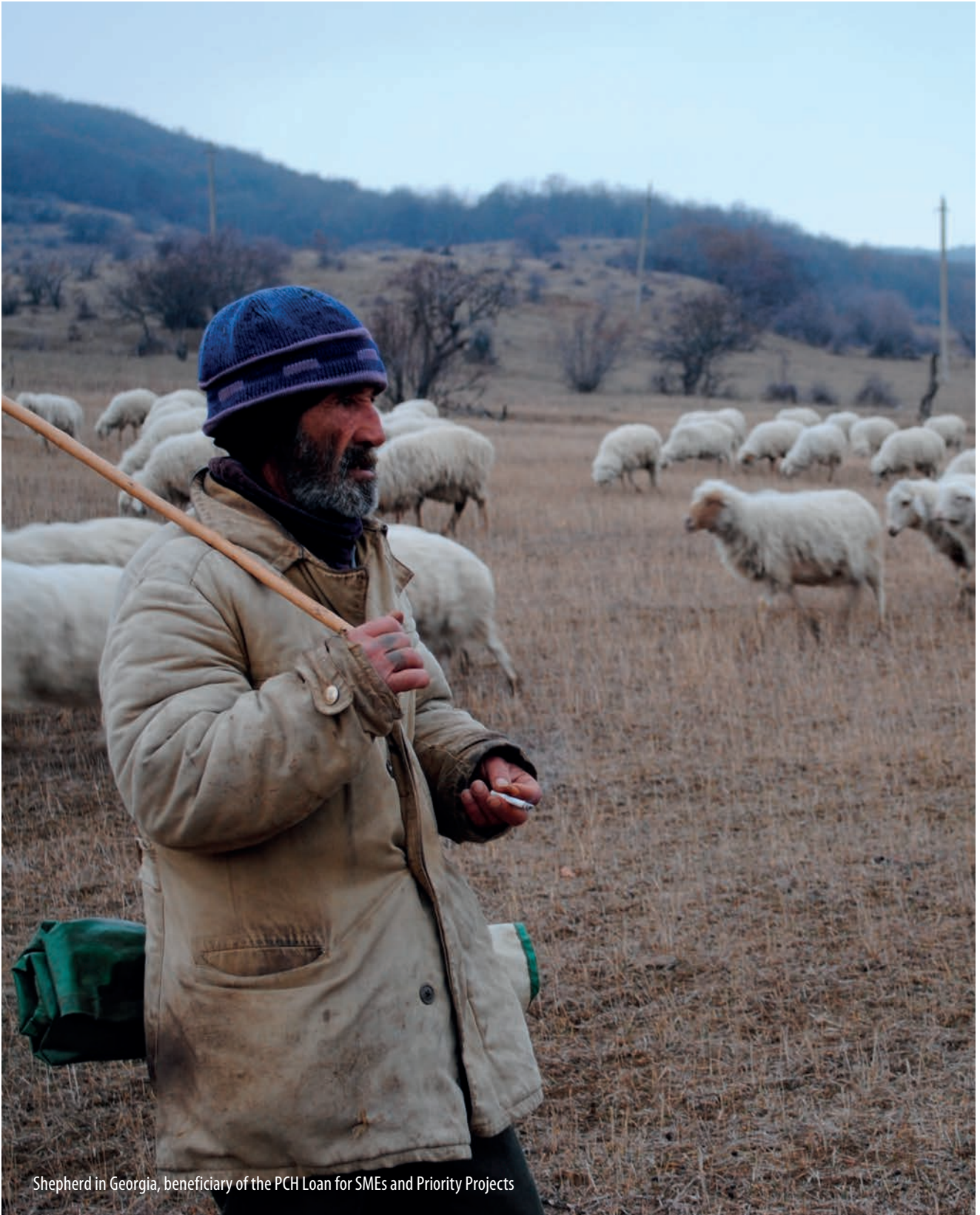
Shepherd in Georgia, beneficiary of the PCH Loan for SMEs and Priority Projects