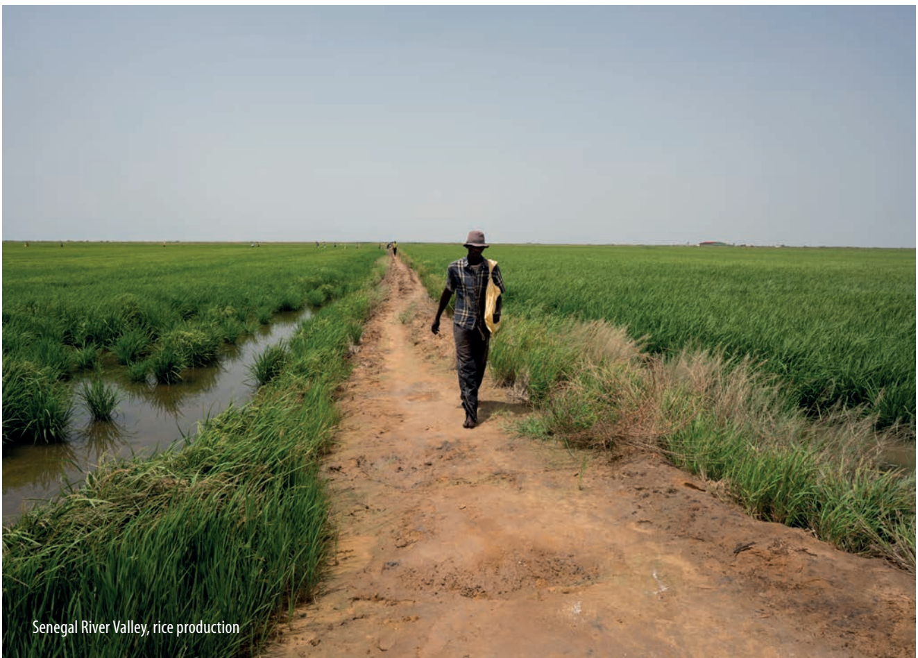
Senegal River Valley, rice production