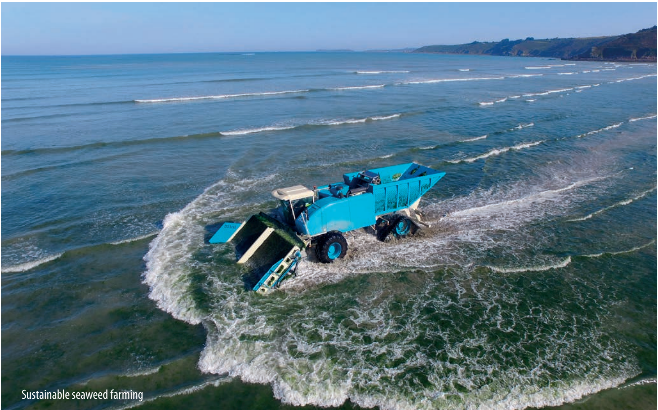
Sustainable seaweed farming

Investing in agricultural supply chains and rural areas is crucial to addressing the growing demand for healthier food and tackling challenges such as soil degradation, food waste, pollution and climate change. The agriculture sector is also likely to see a continuing need for investment to upgrade physical assets, enhance the use of digital technology in production processes and improve resource efficiency. Innovation is crucial for the future of the agricultural sector. The shift to a low carbon and circular economy creates potential new markets for agricultural products with an increasing demand for biomass (for bioenergy) and bio-based materials for products, ranging from biodegradable packaging to make-up. In a nutshell, balanced and sustainable territorial development supports cohesion and requires investments in both rural and urban areas.