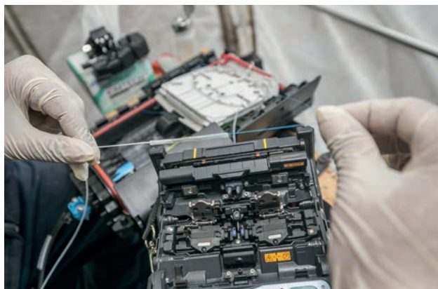
Expansion of the promoter's open access fibre optic network in Ireland

A Portfolio Risk-Sharing Loan financial instrument with total funding of €94 million made available by the Romanian authorities from their Rural Development Programme. It is expected to result in a portfolio of new loans of up to €126 million for at least 350 farmers and agricultural SMEs. The measures covered by the instrument include investments in physical assets