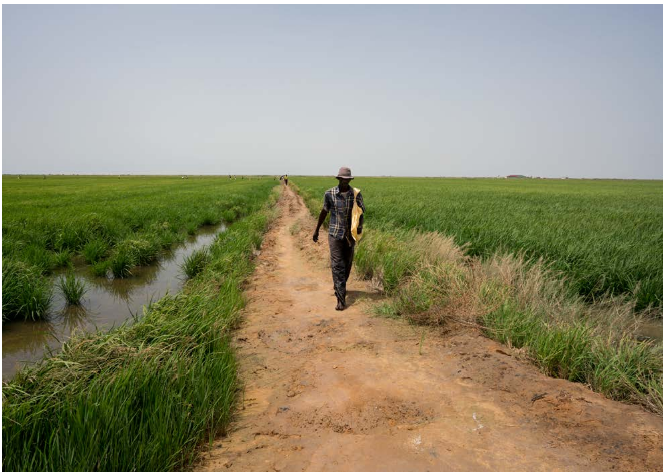
Senegal River Valley, rice production.