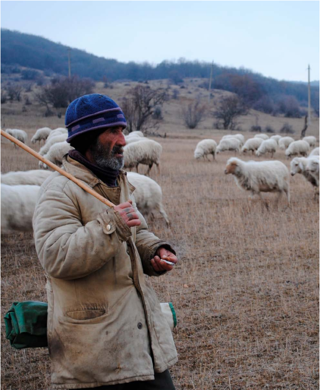
Shepherd in Georgia, beneficiary of the PCH Loan for SMEs and Priority Projects.