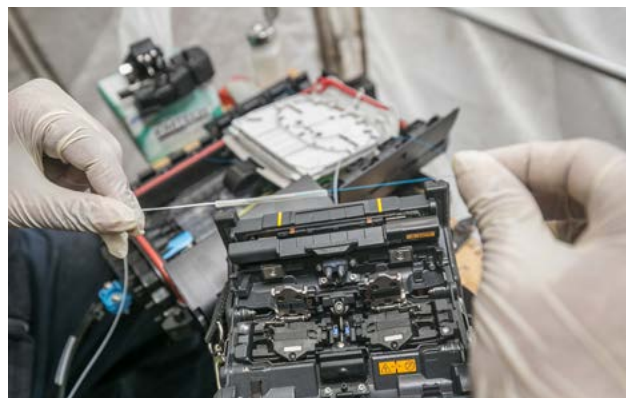
Expansion of the promoter's open access fibre optic network in Ireland.

A portfolio risk-sharing loan financial instrument with total funding of €94 million made available by the Romanian authorities from their rural development programme. It is expected to result in a portfolio of new loans of up to €126 million for at least 350 farmers and