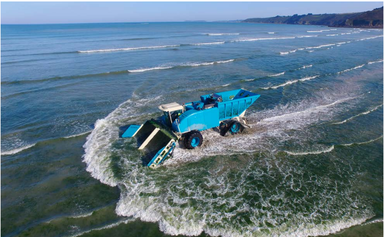
Sustainable seaweed farming.

Investing in agricultural supply chains and rural areas is crucial to addressing the growing demand for healthier food and challenges such as soil degradation, food waste, pollution and climate change. The agriculture and bioeconomy sector is also likely to see a continuing need for investment to upgrade physical assets, enhance the use of digital technology in production processes and improve resource efficiency. Innovation is crucial for the future of the bioeconomy sector as a whole. The shift to a low-carbon and circular economy creates potential new markets with an increasing demand for biomass (for bioenergy) and bio-based materials for products ranging from biodegradable packaging to make-up. In a nutshell, balanced and sustainable territorial development supports cohesion and requires investments in both rural and urban areas.