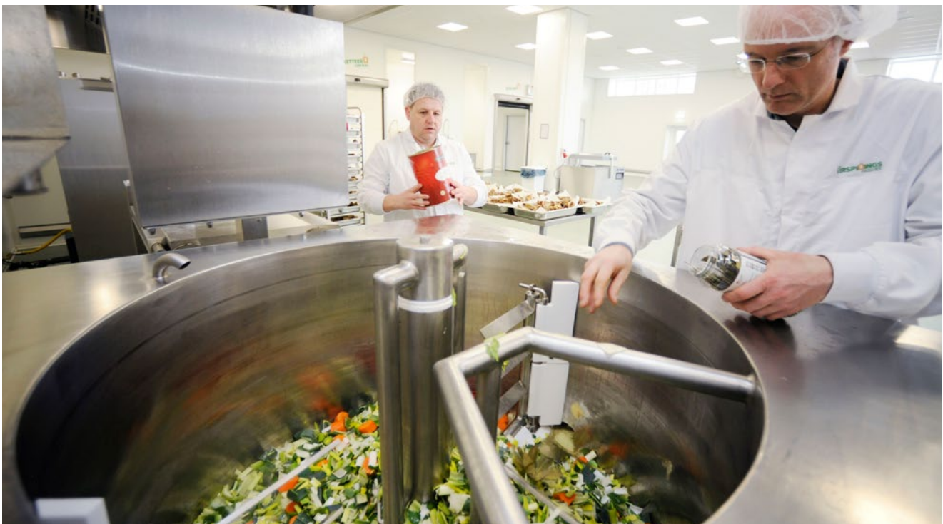
Verspillingsfabriek in the Netherlands transforms discarded and surplus food into fresh new products, such as soup and sauces. It is a beneficiary of a special impact loan developed by the EIB together with Rabobank.

Finally, awareness-raising and partnerships are key to enabling the transition to a circular economy. This is why we work with other financiers and key stakeholders to develop and share knowledge on the definition and financing of circular economy projects. For example, we have launched the Joint Initiative on Circular Economy together with the European Union's largest national promotional banks and institutions, with the goal of investing at least €10 billion in the circular economy by 2023 . Together with the Advisory Hub we have also launched the Circular City Funding Guide website.