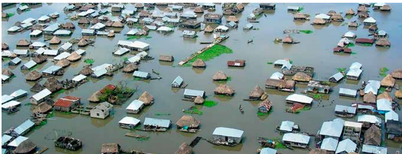
Flood in Cotonou, Benin.

The EIB provided a €38.5 million financial and technical support package to transform renewable power generation in Burkina Faso and better protect its capital city from future flooding. This support for clean energy and climate adaptation will improve access to energy in the country and help address public health challenges and economic risks caused by extreme weather. The EIB's support will help expand the capacity of the Sonabel solar plant from 37 MW to 50 MW.