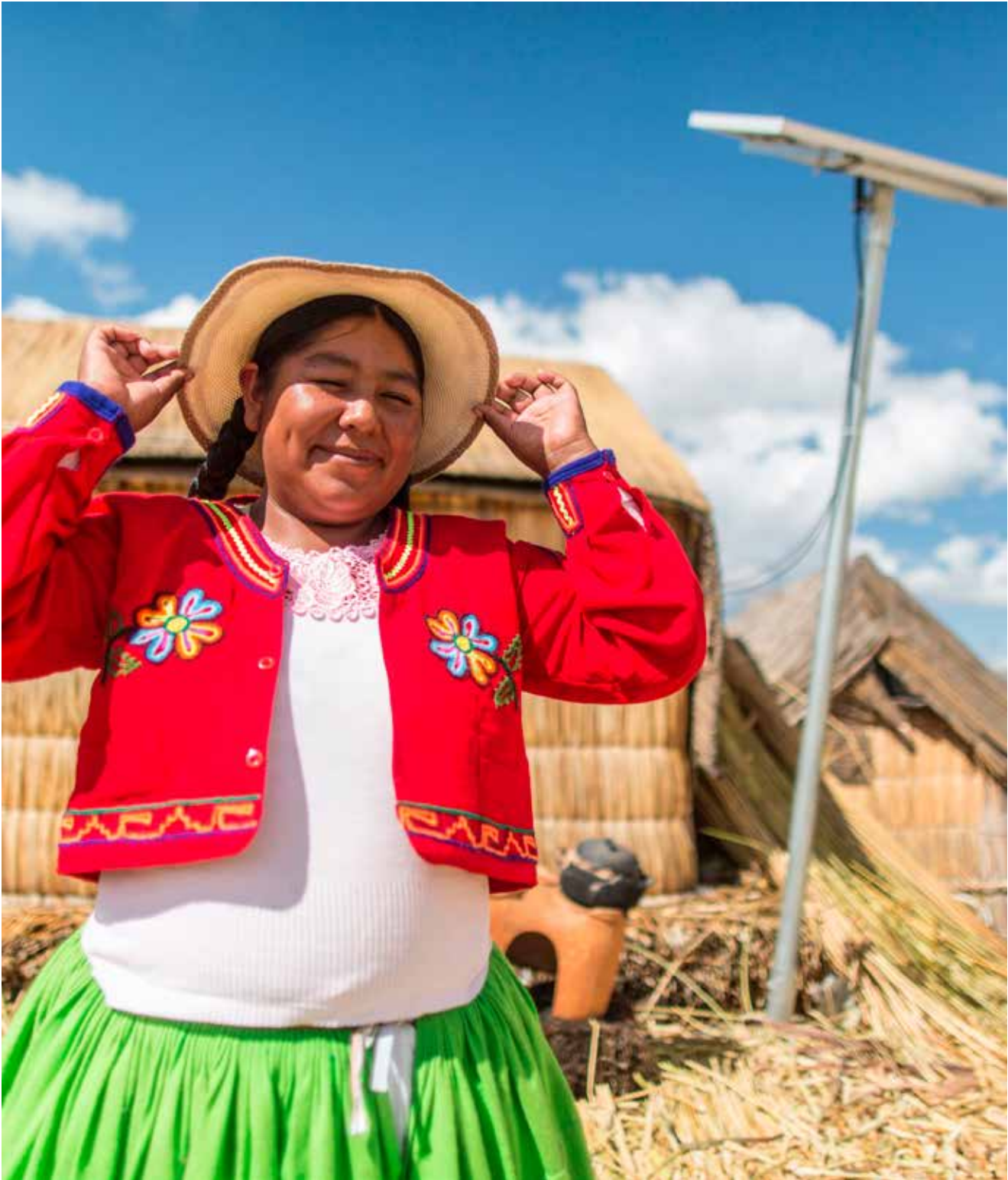
COFIDE Climate Action FL.