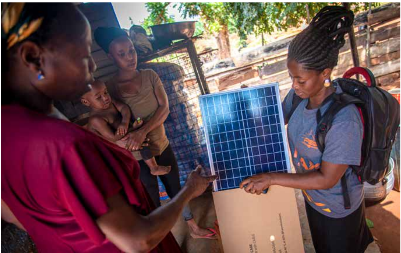
2x Challenge - Off-grid solar company PEG Ghana.

The EIB is looking closely at how to track its results and measure its impact on gender equality. To this end, the EIB uses the 2X challenge criteria , which have been jointly adopted by a group of 15 development finance institutions (DFIs), to define what to count as financing for gender equality outside the European Union. The criteria focus on women's entrepreneurship, leadership, quality employment and consumption (access to products and services that can close a gender gap). The EIB uses similar criteria for its operations inside the European Union. The EIB was the first multilateral development bank to join the 2X community of practice and to formally adopt the 2X challenge criteria, which are increasingly becoming industry standard criteria for gender lens investing in the financial sector.