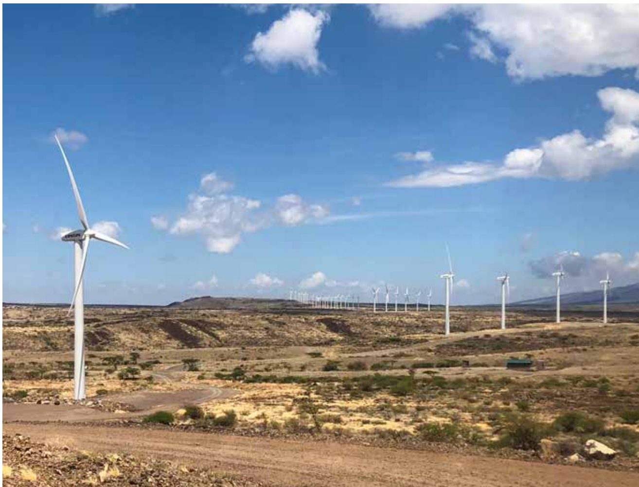
Lake Turkana Wind Power.