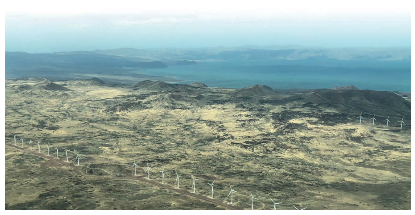
365 wind turbines were built in North Kenya's Lake Turkana region.

A second front is the shift to low-carbon power and heat production. The costs of wind and solar energy have decreased significantly in recent times, making them competitive with conventional power sources even in the absence of a strong carbon price signal. However, wind and solar energy need large-scale storage facilities, as wind and solar farms are intermittent – meaning that they only produce energy when the wind blows or the sun shines.