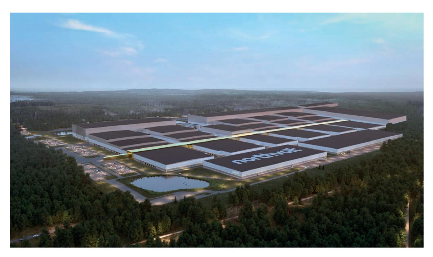
Europe's first homegrown gigafactory for lithium-ion battery cells, Northvolt Ett, in Sweden.

An EIB loan of €60 million supports breakthrough floating wind energy technology in Portugal. Located 20 km off the Viana do Castelo coast, the project will speed up the commercial rollout of a novel technology that enables abundant wind resources to be harvested in deep waters where mounting foundations on the sea floor is not possible. The loan was granted through the InnovFin Energy Demonstration Projects programme, which allows the EIB to finance innovative first-of-a-kind demonstration projects at a pre-commercial stage.